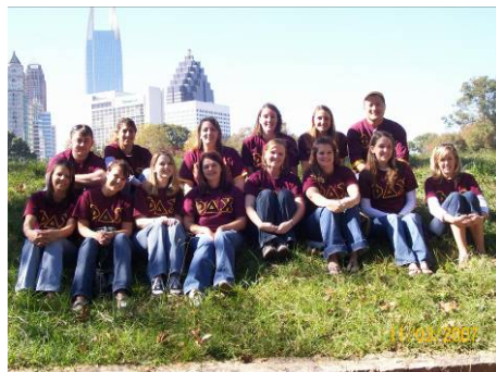
Alpha Delta Brothers at Founders Day in Atlanta, GA