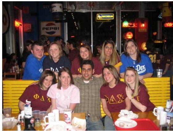
Alpha Delta Brothers at PDC Southeast Regional Meeting in Charlotte, NC