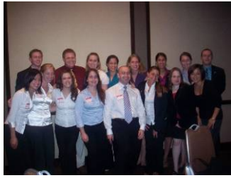
Alpha Delta and Iota Brothers at the Etiquette Dinner